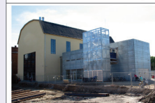
Cultural Centre Proev-hallen