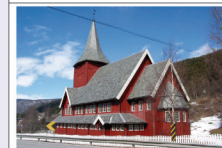
Church Hol Commune