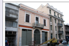
Evonymos Ecological Library