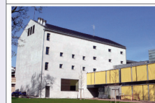
Social Centre "Brewery"