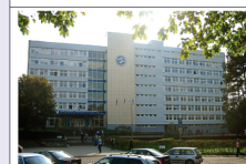
Main Building Vilnius Gediminas University