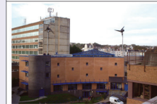
City College Plymouth