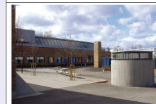
Borgen Community Centre